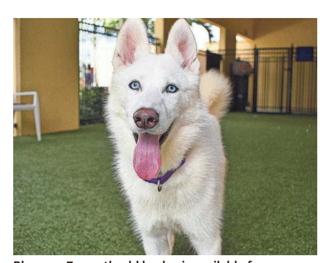
Blanca, a 7-month-old husky, is available for adoption at the Peggy Adams Animal Rescue League, 3100/3200 N. Military Trail, West Palm Beach. For more information, visit PeggyAdams.org.