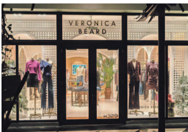
The Veronica Beard boutique PROVIDED PHOTOS