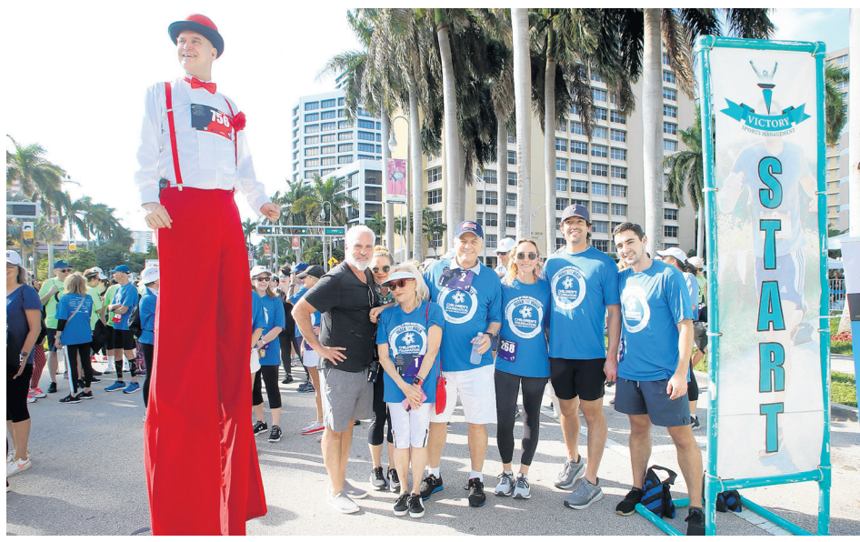
Beaches Marathon.

Visit childrensfoundationpbc.org, call 561-488-6980, or email foundation@ childrensfoundationpbc.