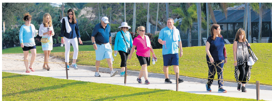
The Children's Foundation of Palm Beach County will have the inaugural "Walk the Walk" to support children's charities with the Children's Foundation of Palm Beach County. Pictured above is a past walk that Boca West Children's Foundation used to hold called A Walk in the Woods. The Children's Foundation of Palm Beach County is directly tied to the Boca West Children's Foundation.

Coconut Creek is 31-67 under Edmond as they seek to get back to the post-season. The last time the Cougars reached the state series was in 2015-16 when they finished 18-10 and fell to the eventual state champion Poinciana, 62-55, in the Class 5A regional finals.